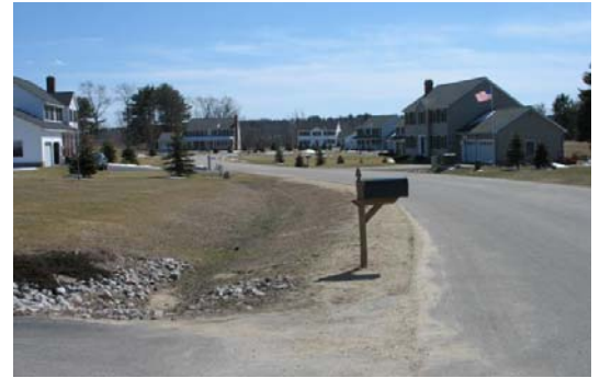
Open drainage system on Christmas Tree Lane in Milford

Open and closed drainage - this bioretention swale (open) treats sidewalk runoff before it is directed into the storm water system (closed).