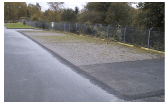
Permeable Parking Lot Demonstration - Open Drainage Seattle, WA