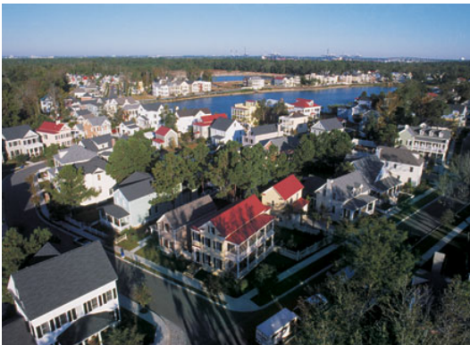
I'on Village, SC.

I'on Village, SC—I'on Village, located in Mount Pleasant, SC, is a modern development rooted in the architecture and design of the area's historic cities. Much like Charleston, Savannah, and Beaufort, I'on Village features a grid layout and mixed-use development. It has received several awards, including the 2001 Platinum award for Best Smart Growth Community in the Nation from the National Association of Homebuilders.