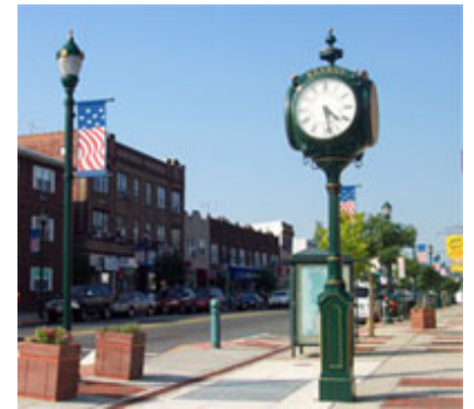
Kearny, NJ.

Kearny, NJ—The Town of Kearny, NJ is home to a diverse population of 40,000. Kearny has a number of features that make it an attractive place to live, including safe streets, a variety of housing types, access to public transportation, an active recreation program, and a true town center.