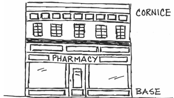
Rockingham Planning Commission's Village Design Model Ordinance

The VPA is based on the best examples of village design and Traditional Neighborhood Design (TND), scaled to a rural setting. A VPA development should be designed at the human scale and provide for pedestrian access, clear delineations of public and private spaces, and connections between residential and small-scale retail areas.