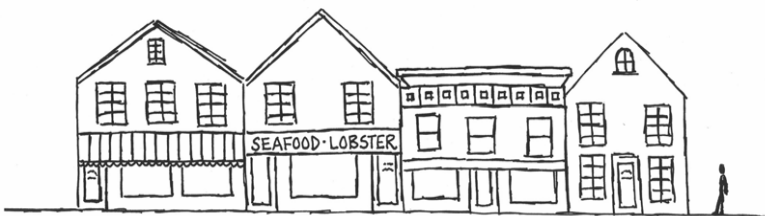
Buildings shall relate to scale and design to the surrounding buildings and the human environment- Village Design Model Ordinance, Rockingham Planning Commission

“VPA addresses economic, environmental and social consequences by promoting the smart growth principles of compact, mixed-use development, preserving the working landscape, and protecting environmental resources...”