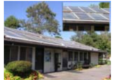
Passive solar design - a house oriented towards the sun with solar panels