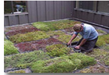
Green Roof on the TF Moran building in Bedford, NH

Providing a set of incentives for energy efficient design may draw interest among builders and developers. While the initial cost of energy efficient systems is typically higher than conventional systems, paybacks are usually seen in less than ten years, and as quickly as a few years. Incentives can help lessen the initial cost burden by providing a subsidy through tax deferments, deductions, credits, or abatements. Other incentives include: expediting the site/subdivision approval time, awarding developments a special certification status, and providing density bonuses. The developer may also be eligible to take advantage of net metering or receive a refund for excess power generated on site and returned to the grid. Whatever strategies a community chooses to use, it must first identify energy efficient development as a community priority in the Master Plan.